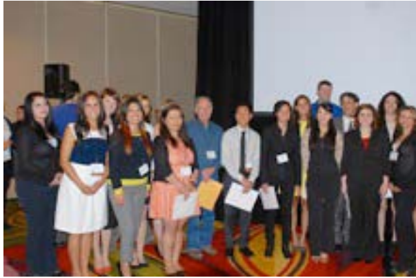
WPA Award Recipient Photo