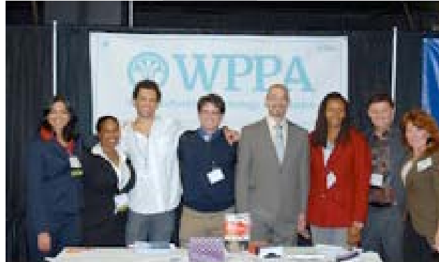
Exhibitors included the Western Positive Psychology Association