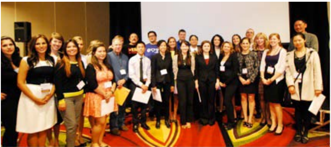
WPA Award Recipient Photo