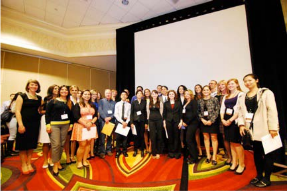
WPA Award Recipient Photo