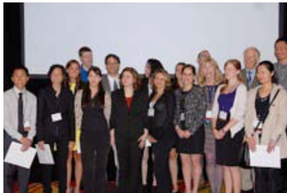
WPA Award Recipient Photo