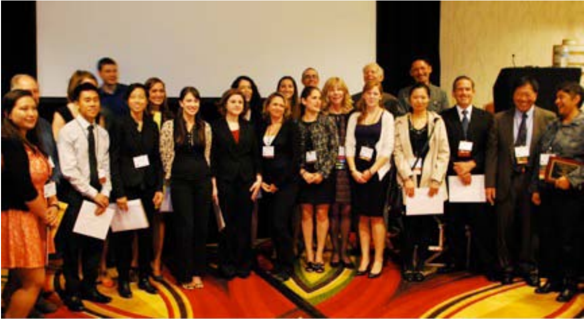
WPA Award Recipient Photo