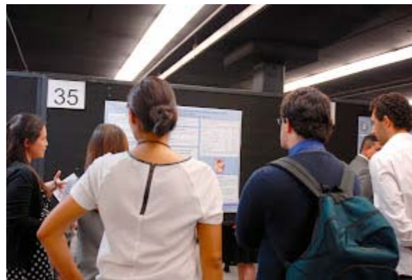
Over 900 posters were presented during the four days of the convention