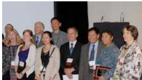
WPA Award Recipient Photo