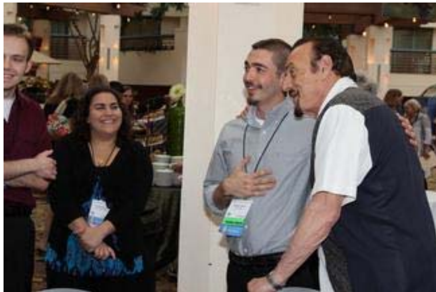
Friday Reception in the Hyatt Atrium