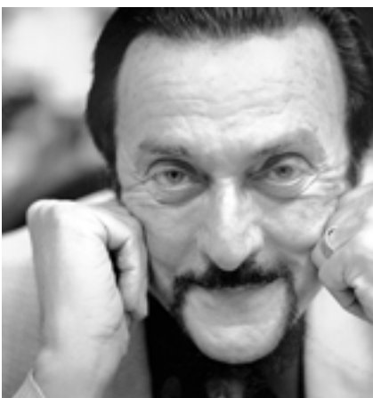
Philip G. Zimbardo